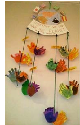
Artwork submitted by Little Promises Day Care

Smart Starts Preschool Interamerican Learning Centre Elite Kids Enrichment Center Get Smart Kids Academy Maria Soto Large Family Child Care Home Kids Land Day Care Holy Comforter Day Care Center Little Promises Day Care Little Promises Day Care II Coral Villa Christian Academy Poinciana Park Elementary Head Start St. Albans Child Enrichment Center 3465 St. Albans Child Enrichment Center 6060 Bethune Head Start & Child Care Center Colonial Drive Elementary Head Start and Child Care Center Lincoln Marti Our Lady of Lourdes Noah's Ark L.C. New Generation Preschool Happy Kids Childcare Happy Children of Overtown Paradise Christian ARC Project Thrive Kendall Little Star Day Care Athalene Clay The Thinking Child Academy Gratigny Day Care Young Presidents Club CCC Sheyes #2 Head Start Sheyes #4 Born 2 Learn Villa Learning Center Coral Villa Christian Academy University Christian Children's Center Precious Little Steps Learning Center