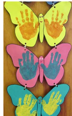
Artwork submitted by Interamerican Learning Center

Smart Start at City Church Smart Starts at Tamiami Smart Starts Day School Smart Starts Day School (1101) Smart Starts Day School (8445) Smart Starts Day School III Smart Starts Early Learning Center Smart Starts Learning Center